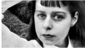
Carson McCullers The Lone Slayer