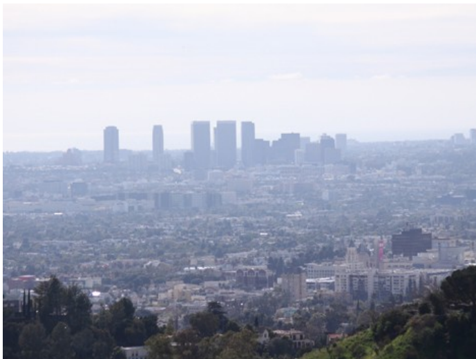
Los Angeles: The occupants are daily in traffic jam.

Los Angeles is an Autostadt. Many of their residents have never used the subway. The conference re: street wants to provide new perspectives - with a dance choreography on the Red Line. On the whole line is danced, and for several hours.