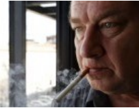
Ulrich Gregor about the bear's favorite "Kaurismäki's film is the highlight of the Berlinale"