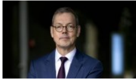
Economist Peter Bofinger What do we leave to future generations?